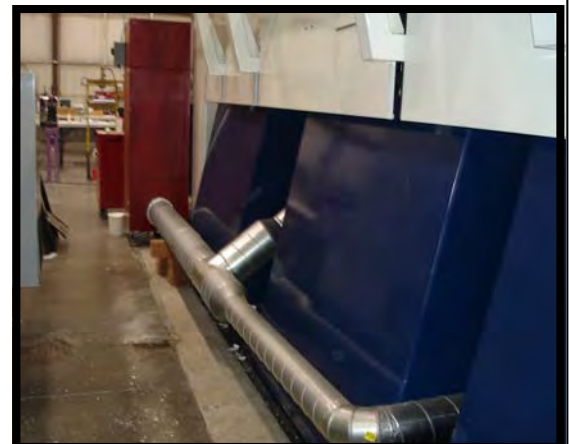
MM1200 Ducted to Machining Center

Phone: 866-566-4276 Fax: 316-219-2995 Email: info@microaironline.com