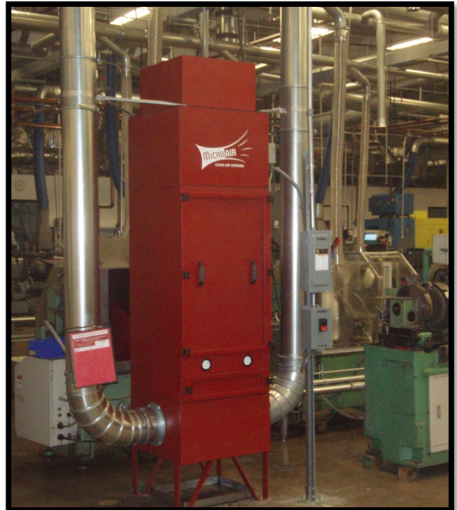
MM1200 Ducted to Machining Centers