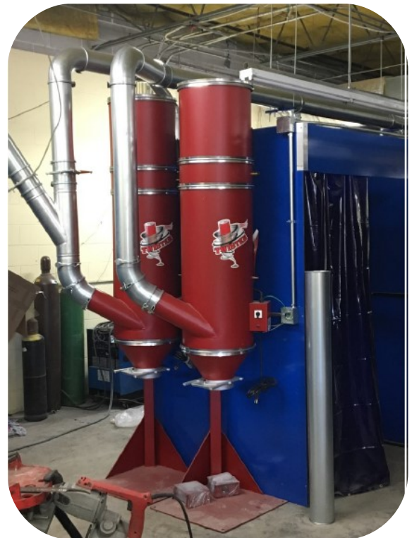
RP1 Ducted to Weld Stations at Union Training School

As the air enters this tube, the force of the pulse causes the tube to rotate incrementally inside the cartridge. While rotating, air exits the pre-drilled holes, resulting in air dispersement over the entire surface of the cartridge, providing for an improved cartridge cleaning cycle, compared to competitive backflush cleaning systems.