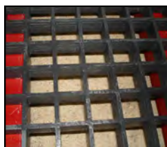
Spark Arresting Sand Trays—Optional